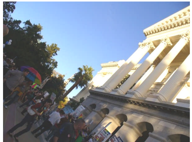
Protest in Sacramento at State Capitol after November 4 election.

The veneer of simplicity in the language of Prop 8 belies a battle of wills between cul-